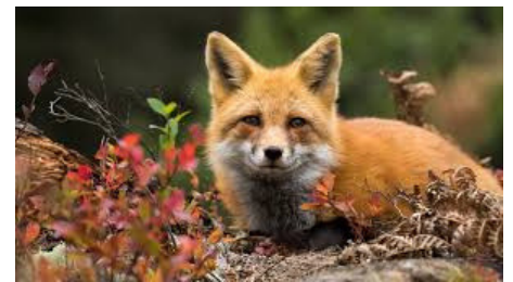
Pupils in KS1 have been writing fact files about foxes.

Key Stage One have been researching foxes for our topic on animals and habitats. The children have used their extensive knowledge to write fact files which use a range of sentence types. They have also been working hard on the presentation and organisation of their work.