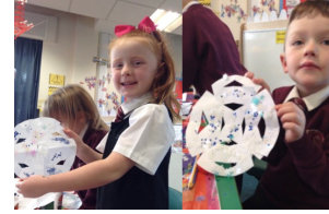
Nursery have been making their own characters!

It's been a chilly start to the new year for Upper Foundation. We are walking in a "Winter Wonderland" this half term and will be learning about all things 'winter'. This week we have discussed the seasonal change of winter, explored the Julia Donaldson story ' Gruffalo Child ' and started to build models using and naming 3D shapes. We have also made some icicles for our role play area, exploring repeating patterns, practicing our cutting skills and of course our creative skills!