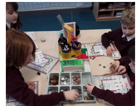
Children in Year 3 applying their money skills!

Lower Key Stage 2 are studying ' Horace and Harriet Take on the Town '. We will be comparing the town in our story to Pontefract and creating maps and illustrations in the style of the author. We will be writing character descriptions, completing drama activities and expanding our vocabularies with new 'splendiferous' words! As the story is about a statue that comes to life we will be creating art that celebrates important people.