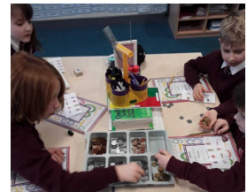
Children in Year 3 applying their money skills!

Lower Key Stage 2 are studying ' Horace and Harriet Take on the Town '. We will be comparing the town in our story to Pontefract and creating maps and illustrations in the style of the author. We will be writing character descriptions, completing drama activities and expanding our vocabularies with new 'splendiferous' words! As the story is about a statue that comes to life we will be creating art that celebrates important people.