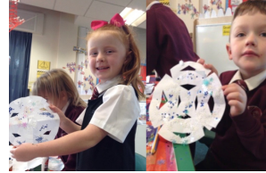
Nursery have been making their own characters!

It's been a chilly start to the new year for Upper Foundation. We are walking in a "Winter Wonderland" this half term and will be learning about all things 'winter'. This week we have discussed the seasonal change of winter, explored the Julia Donaldson story ' Gruffalo Child ' and started to build models using and naming 3D shapes. We have also made some icicles for our role play area, exploring repeating patterns, practicing our cutting skills and of course our creative skills!